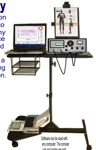
Software can be used with any computer. The computer cart and printer are sold separately.